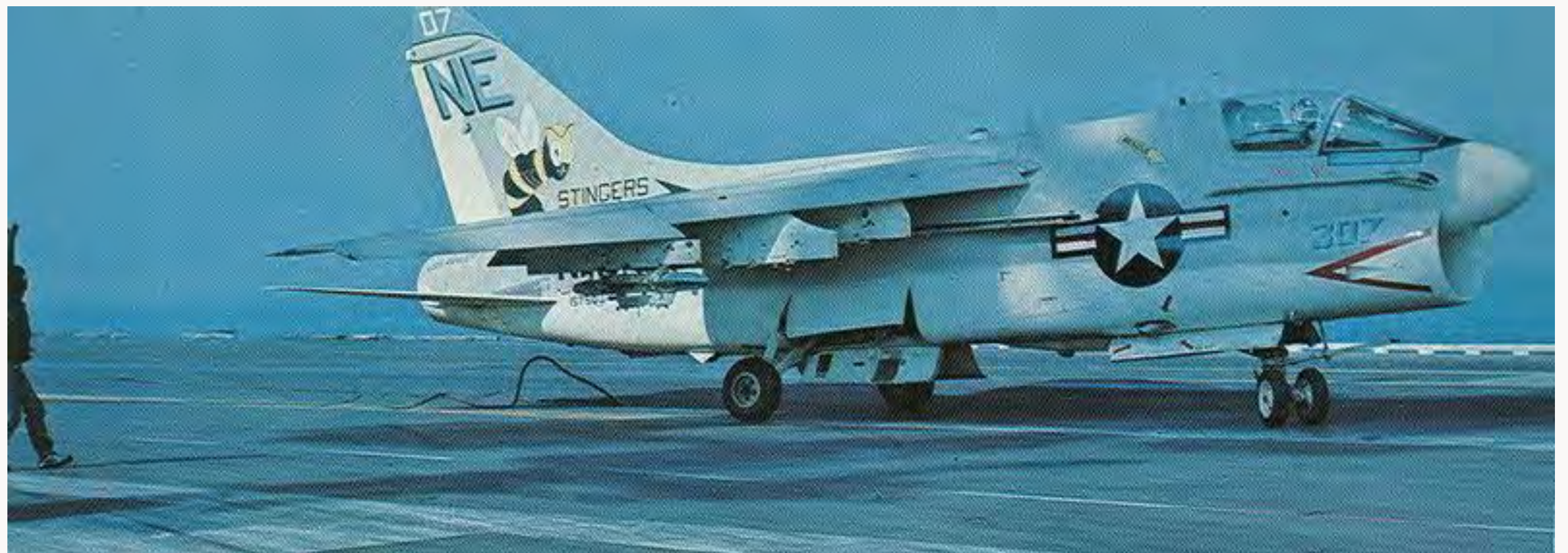
VA-113 A-7E on deck of USS Ranger 1970–71

The Secondary School: https://www.youtube.com/watch?v=ICVDEr00dMo&feature=youtu.be