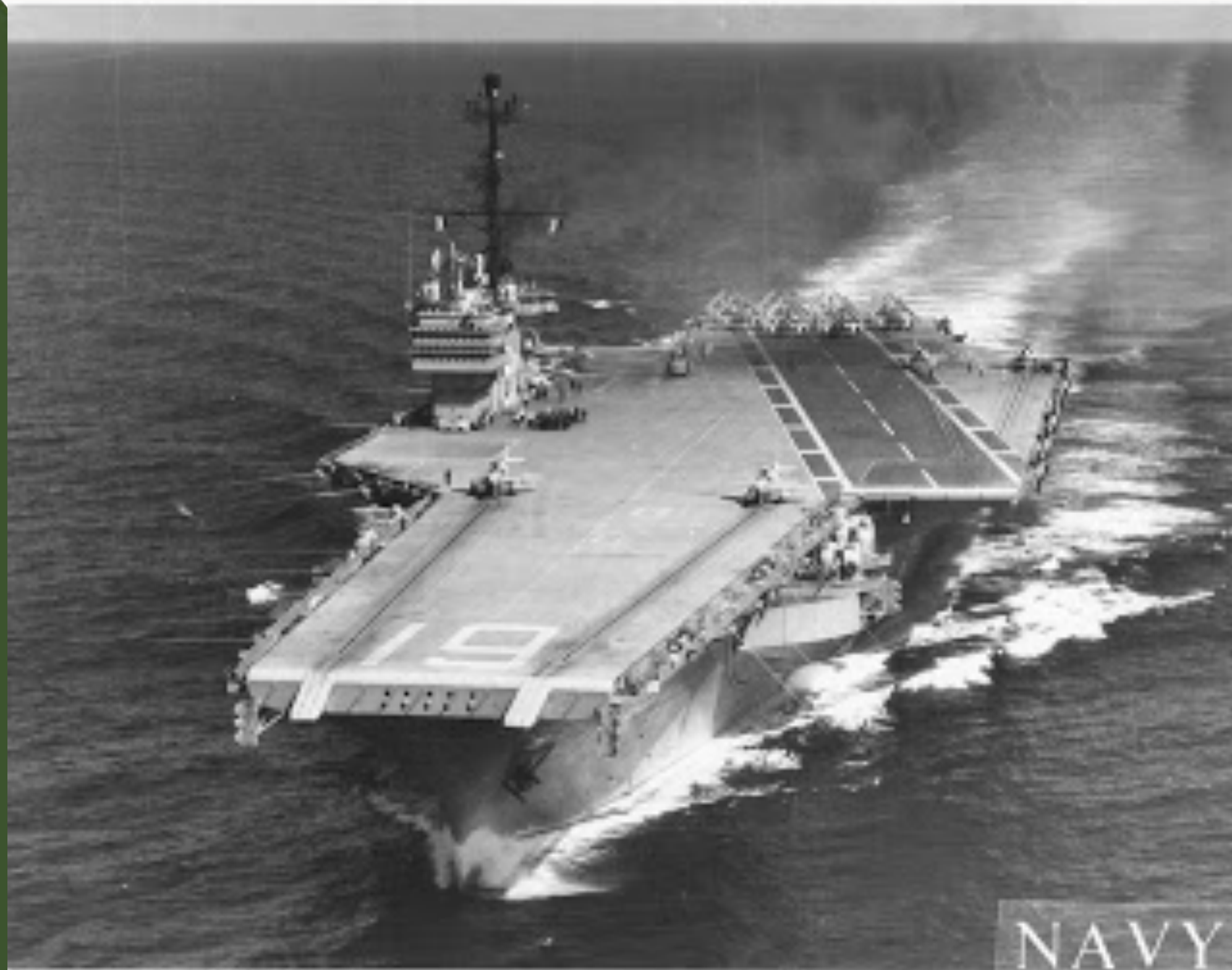
PHOTO: USS RANGER.

With Typhoon Patsy barreling down on the North Vietnamese coast, carriers Ranger, Oriskany, and Hancock mounted the largest night carrier air operation of the war in a massive and ultimately successful air defense diversion & suppression operation in Haiphong Harbor, with the Oriskany sailing at top speed across the Pacific Ocean on a moments' notice to support the mission.